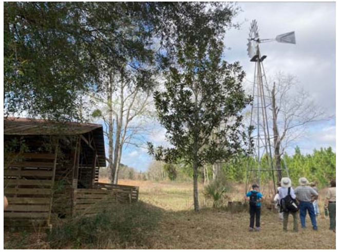
The old windmill