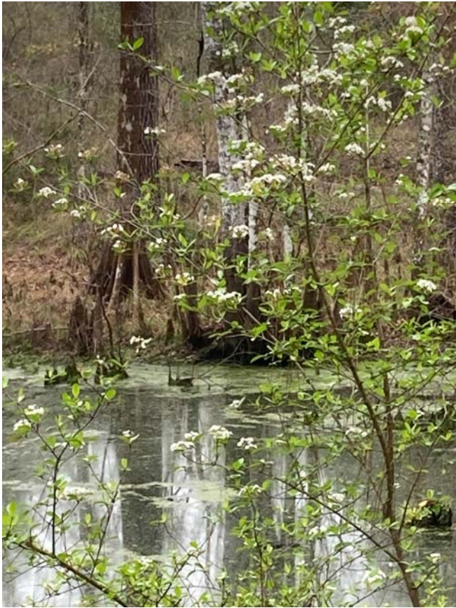
Small sinkhole with blooming Walters Viburnum